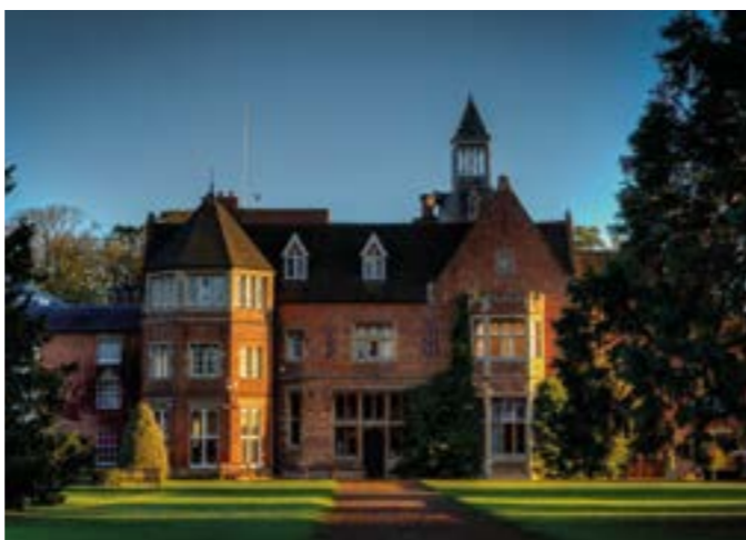
Bilton Grange School

Just as we are prudent in choosing our partners for establishing Rugby School in other countries, so we take great care in establishing and nurturing our relationships with those schools and charities in the UK who help us identify students who will benefit from the Arnold Foundation.